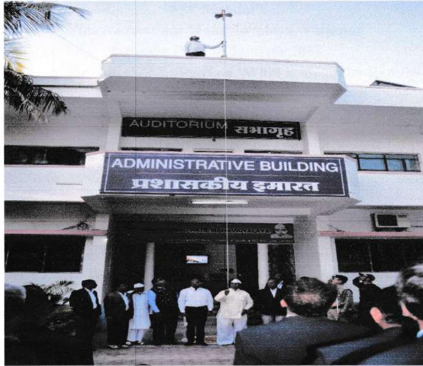
Hon. Kashinath Gaikwad, Member, LGC, hoisting the national flag