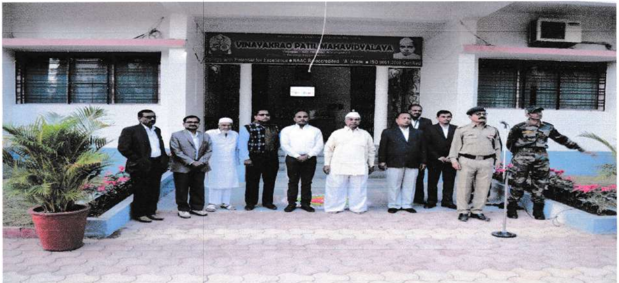
Dignitaries at the flag hoisting programme

He further said that Dr. Babasaheb Ambedkar with his dedicated team worked day and night to draft a very comprehensive constitution for us. Thanks to his hard work and vision today India is marching on the path of progress and prosperity. But in order to be worthy of this legacy we have to be very vigilant because eternal vigilance is the price of democracy. When we cast vote, we have to see that we choose the right candidate.