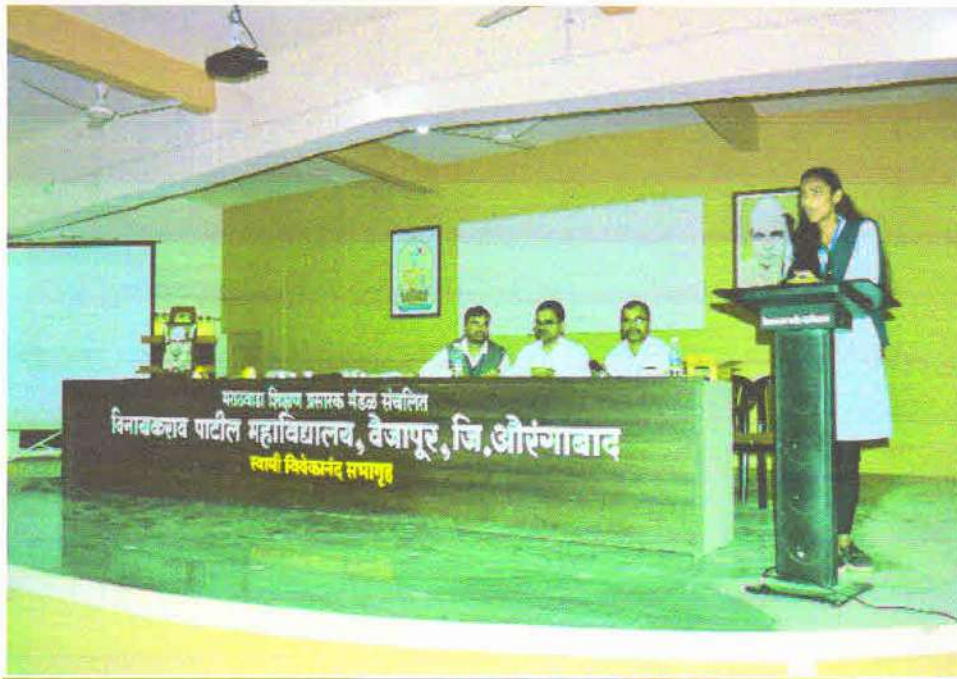
Student speaking at the elocution competition