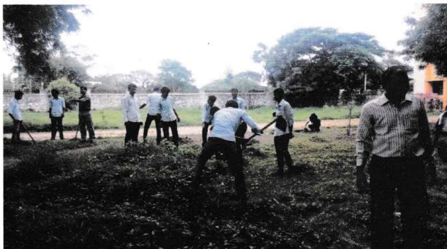
Students eradicating carrot grass

Prof. Dokhe further revealed that the grass has its presence in areas along the railway lines, road sides and other fallow lands. However, it is a matter of concern that it has started to grow in agricultural areas too. Over the last three decades it has affected the crop yield and has had several mutations. The seeds are light and the plants dry after the monsoon is over. However, the seeds are dispersed through wind rapidly again in the next monsoon we see its growth. Prof. Dokhe shared the precautions to be taken while uprooting the grass. He first demonstrated the method of uprooting the plant. He said that August is the right time to eradicate it because there are no seeds formed on the grass and this method works wonder. Accordingly the students were divided in to four groups and eradicated the carrot grass in areas surrounding the IT building, Hostel, Science labs etc. The students observed all care and precaution while doing the work. He asked them to wash hands properly. He said that as the weed was removed in August itself, the students have contributed to the environment in a big way.