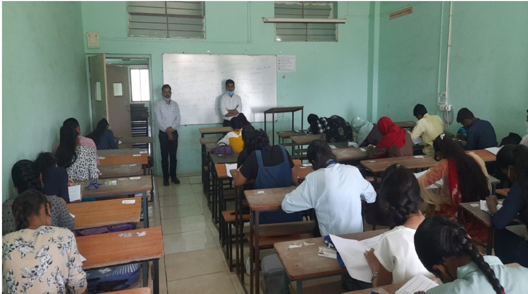
Student taking the QUIZ