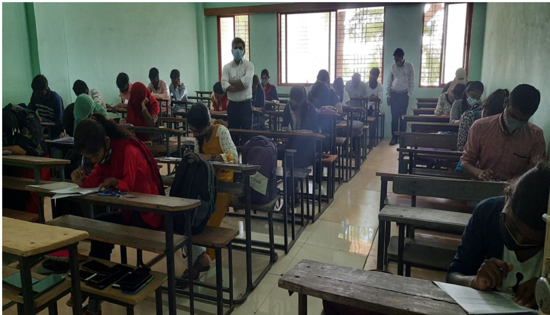
Student taking the QUIZ