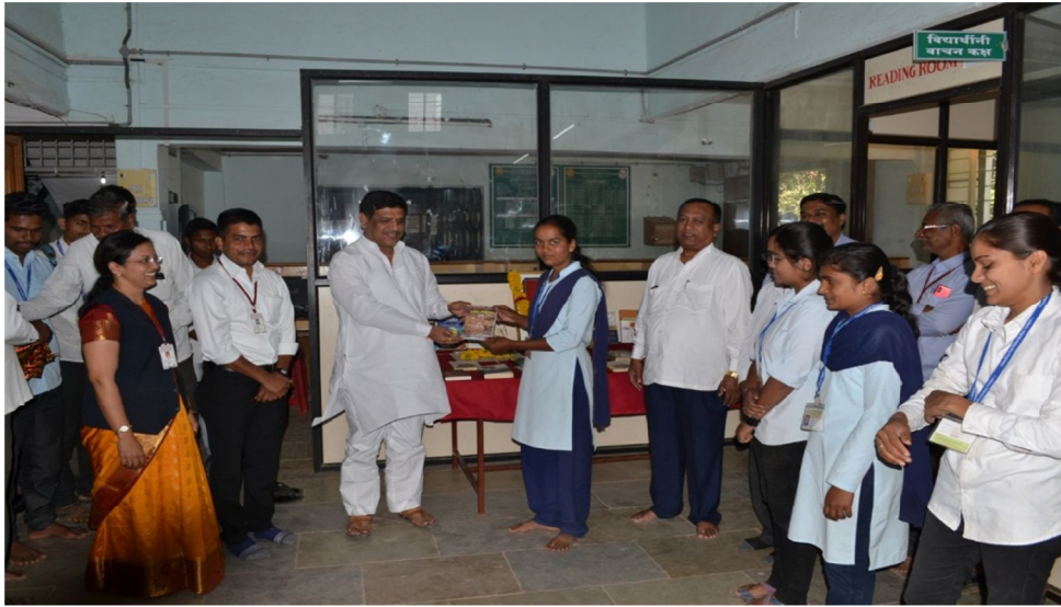
Best Readers awarded with five books