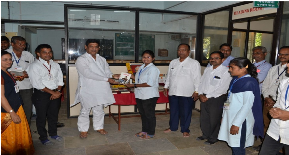
Best Readers awarded with five books