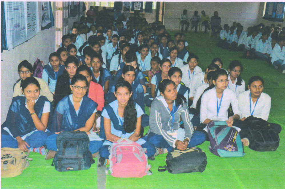
Students attending the programme