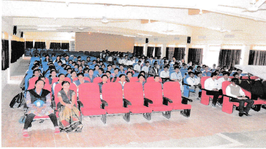
Students and teachers attending the programme